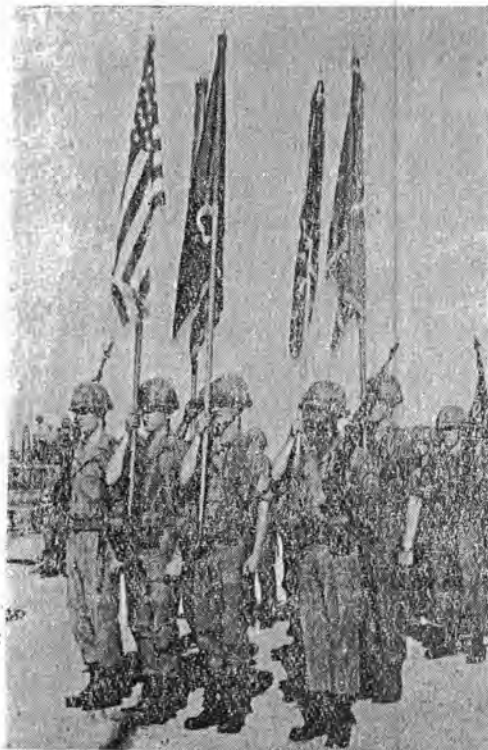
First ashore from the 4th Division's 3rd Brigade were the colors.

The brigade, formed in October 1963, is composed of three infantry battalions, one artillery battalion, one cavalry troop, and organic supporting elements.